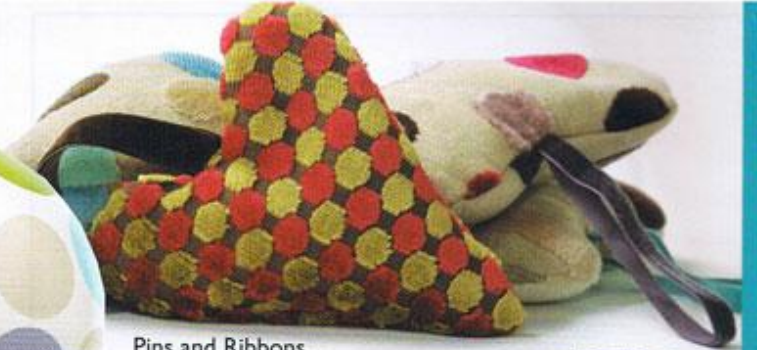
Pins and Ribbons