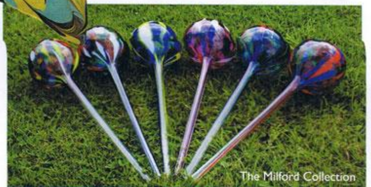
The Milford Collection