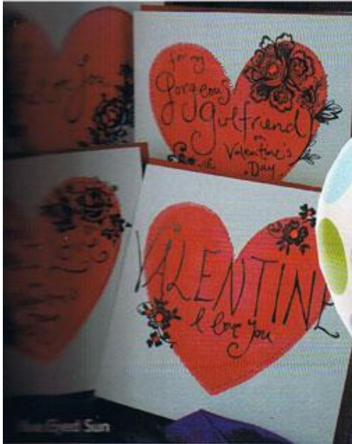
Blue Eyed Sun

Handmade card specialists Blue Eyed Sun have launched a new selection of stylish Valentine cards hand embellished with jewels and printed with love messages on bold watercolour red hearts. The new 'Baroque' range of cards are made on top quality 300gsm board and are sized just at 150mm square. All cards come cello-wrapped with a red envelope. Priced at £1.70 each trade (£3.99 RRP) the designs come in three.